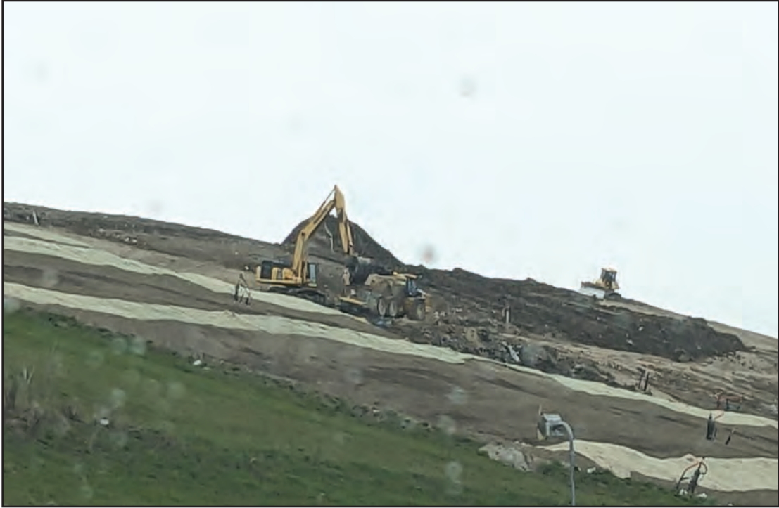
New cap project East slope, berms being armores