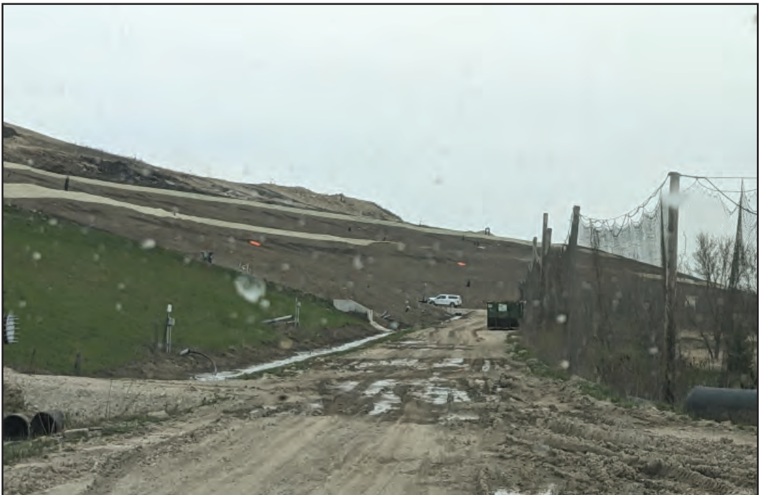
East slopes of landfill footprint