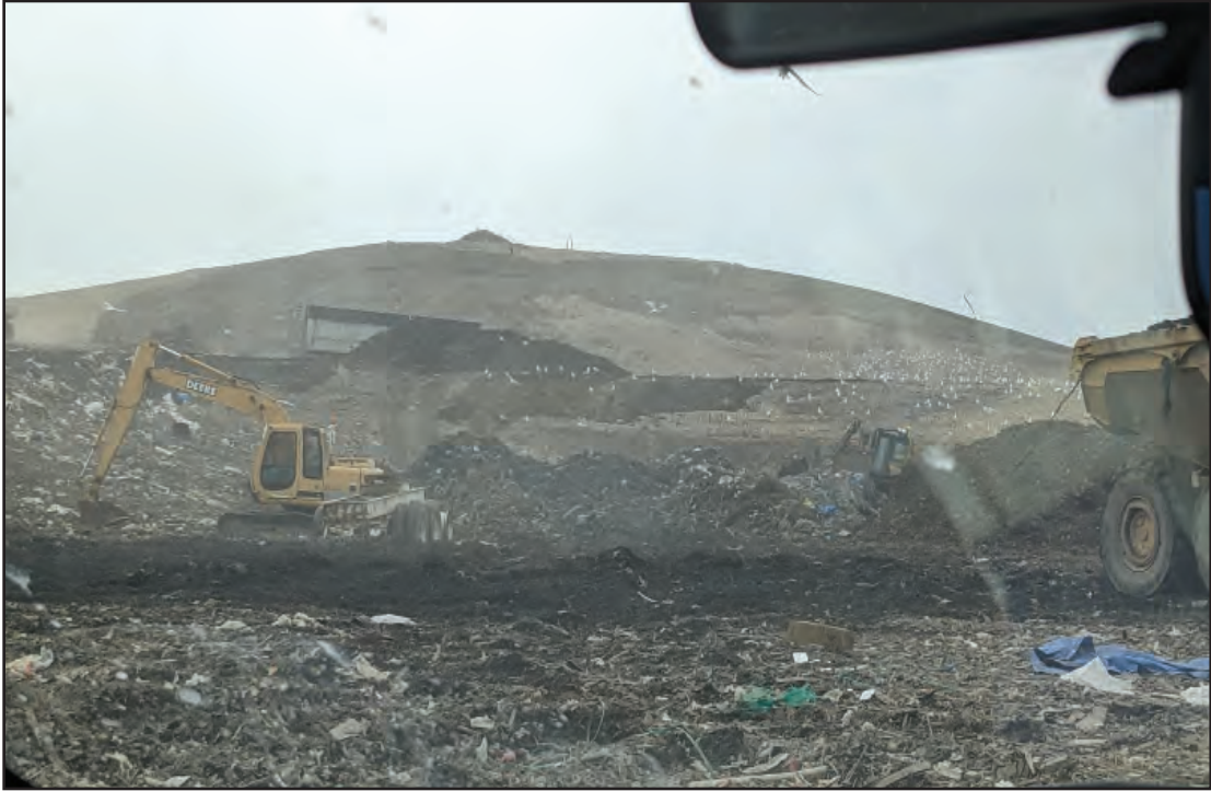
Phase 4 active with new tipping and waste from capping project