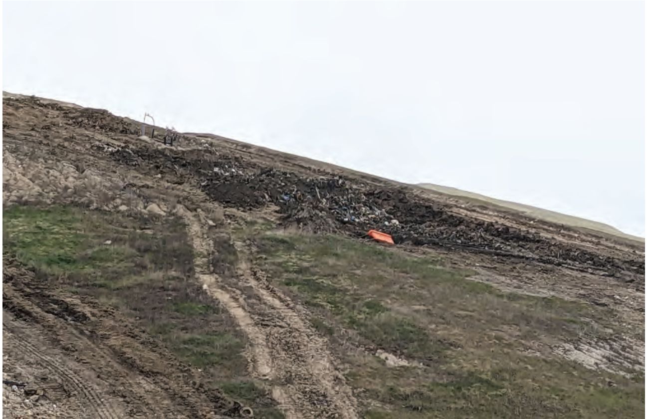
Overburden waste being removed and slope shaped for new cap placement