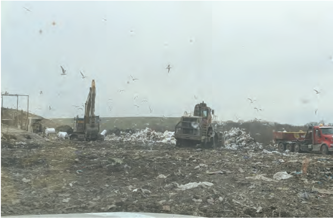
Compactor pushing waste into working face