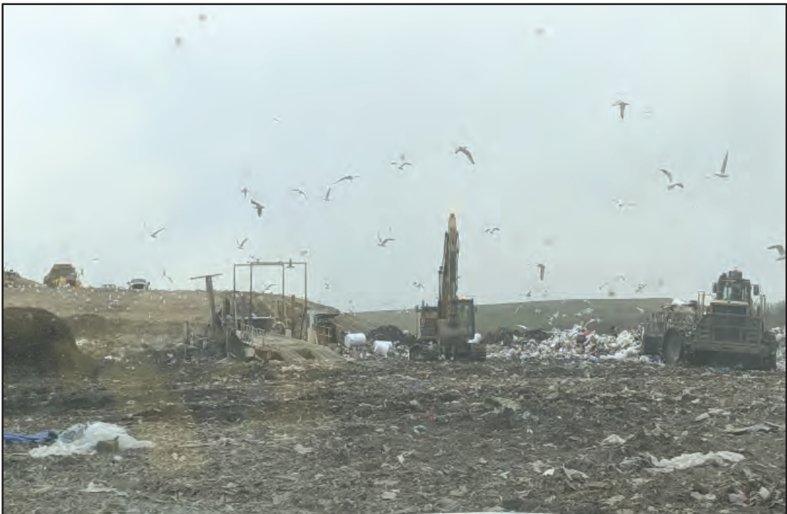
Truck cleanout in Phase 4