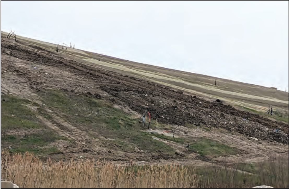
Overburden waste being removed and slope shaped for new cap placement