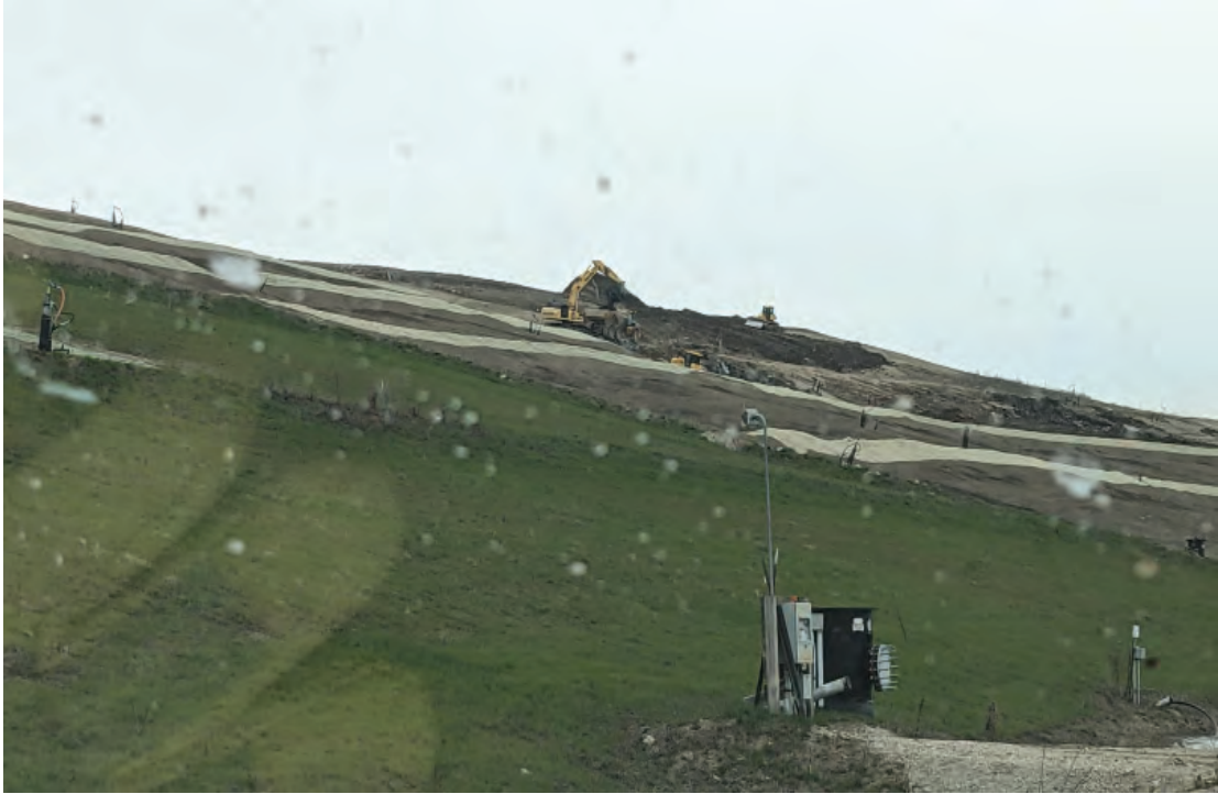
New Cap project