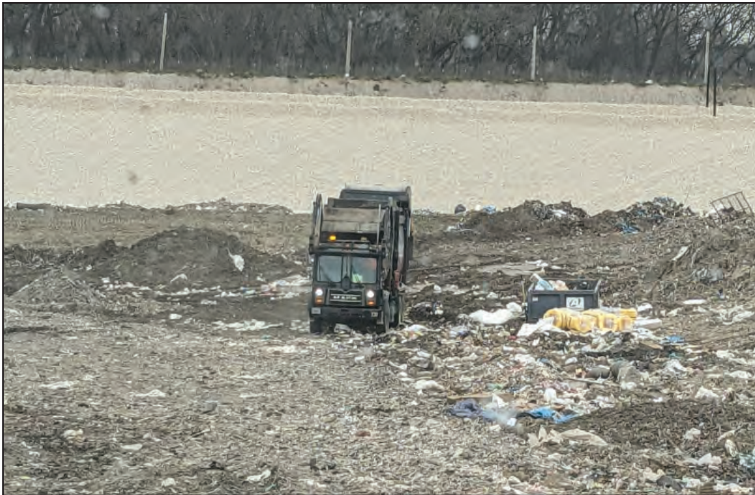
Overview of Phase 4 outside of working face