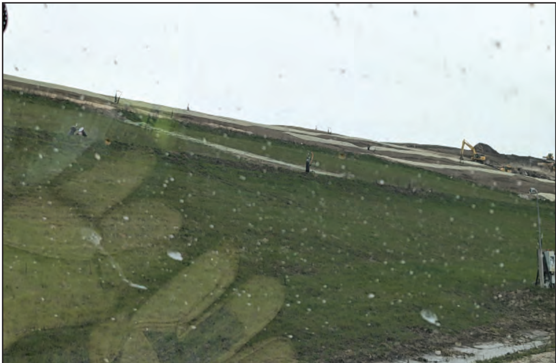
East slope of last years cap project