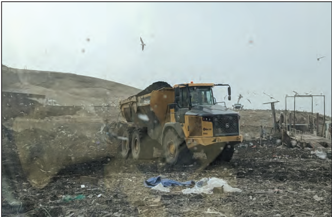
Haul truck bringing excavated waste to Phase 4 working face